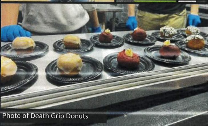
Photo of Death Grip Donuts