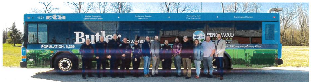
Butler Township officials and Butler Township police officers pose in front of the new "Proudly Serving" Butler Township bus.

Founded in 1817, Butler Township is one of nine townships in Montgomery