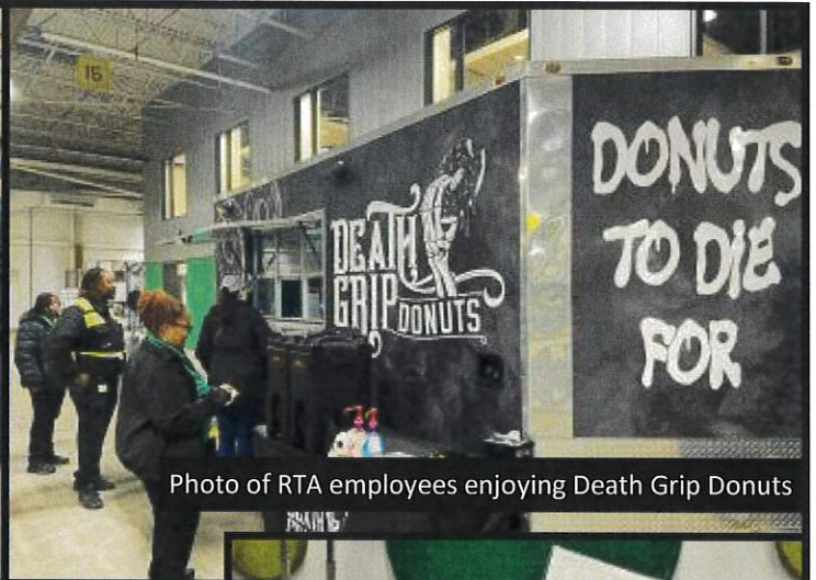
Photo of RTA employees enjoying Death Grip Donuts