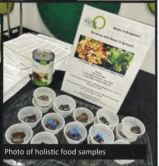
Photo of holistic food samples